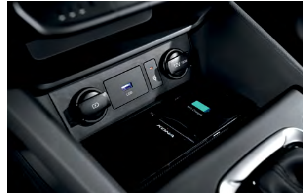
Available wireless charging pad▼