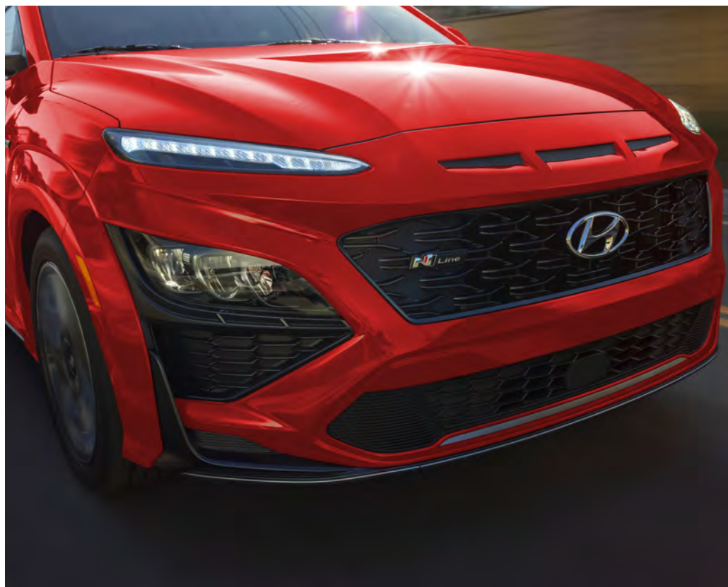
Standard LED daytime running lights Available LED headlights

The new KONA features a distinctive grille design that complements the refreshed headlight cluster. The narrow, piercing look of the standard LED daytime running lights remains a signature and unmistakable design cue. The bold design is reinforced with body cladding details along the wheel arches and rear bumper.