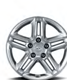
16" alloy wheel Standard on Essential Value Edition and Essential models