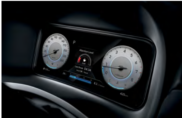
Available 10.25" full digital instrument cluster

Shopping across town? Late-night eats? Get around seamlessly with these impressive features.