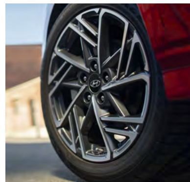
Available 18" alloy wheels