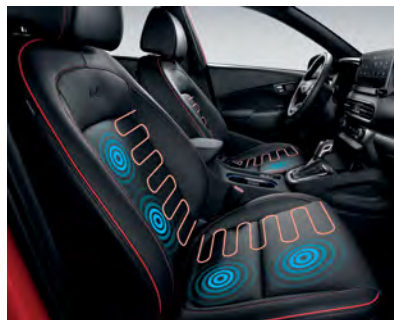
Standard heated front seats Available ventilated front seats