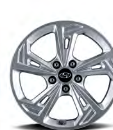
17" alloy wheel Standard on Preferred Special Edition and Preferred models