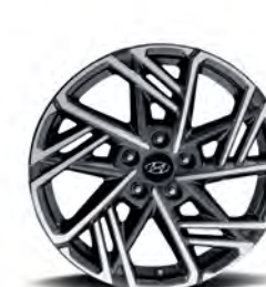
18" alloy wheel Standard on N Line model and N Line model with Ultimate package

*Exterior, interior and roof colour options and/or availability may change without notice. Choice of interior colour is dependent on model and/or exterior colour selection. Colours shown are for reference only and may vary from the actual hue. Visit hyundaicanada.com or see your dealer for details. *Not available on N Line model with Ultimate package.