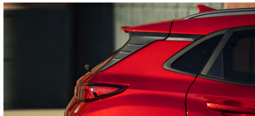
Available LED tail lights Standard rear spoiler