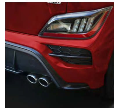
Available twin-tip exhaust