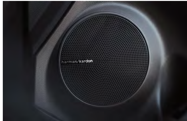
Available harman/kardon® premium audio system with 8 speakers