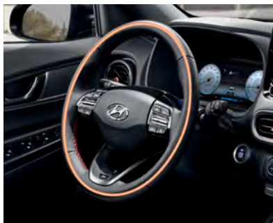
Available heated steering wheel