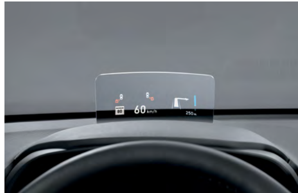
Available Head-Up Display