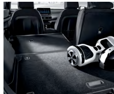
Standard 60/40 split-fold rear seats