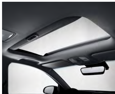
Available power sunroof