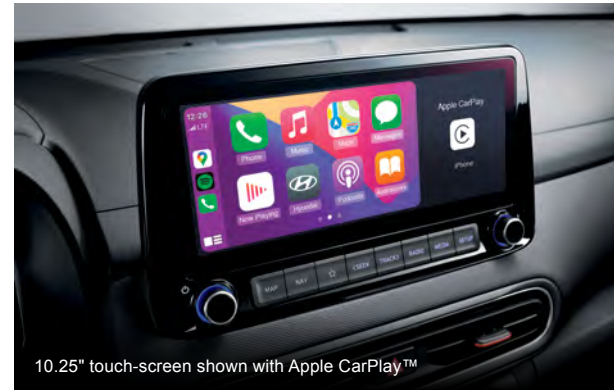
10.25" touch-screen shown with Apple CarPlay™