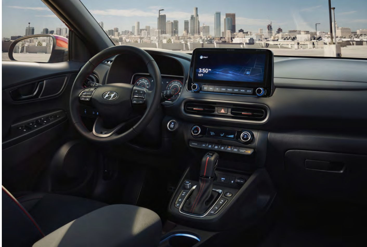
N Line model with Ultimate package shown.

Outside, the newly re-designed KONA makes a bold statement. Inside, the KONA lets its exceptional level of comfort and wealth of features do the talking. The new KONA thinks of you with its standard heated front seats, an available heated steering wheel and an available 8-way power-adjustable driver's seat. When city life heats up, the KONA helps keep you cool with available ventilated front seats.