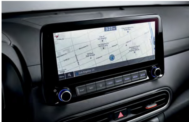
Available 10.25" touch-screen with navigation system