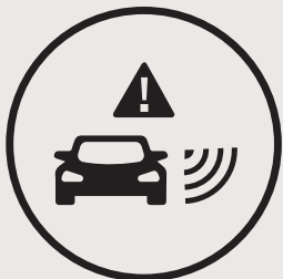
Blind-Spot Collision Warning with Lane Change Assist