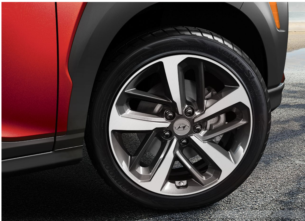
Available 18" alloy wheels

The Kona has been designed to turn heads — and to raise pulses. The dynamic design catches the eye with unique details that highlight the strong Hyundai SUV DNA at its core, starting with our signature cascading front grille design, muscular wheel arches and advanced lighting. Bold body cladding runs along the side profile and rear bumper for a sporty look, and available two-tone colour options on the Trend model let you customize your Kona to suit your style preferences.