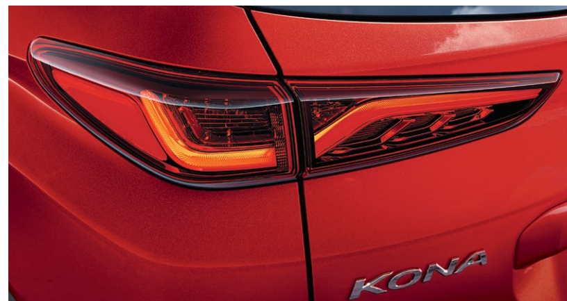
Standard LED daytime running lights and available LED headlights Available LED tail lights