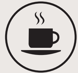
Driver Attention Warning