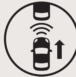
Forward Collision- Avoidance Assist with Pedestrian Detection