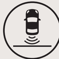
Parking Distance Warning - Reverse