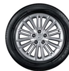
17" alloy wheel