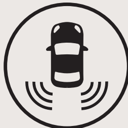
Rear Cross-Traffic Collision Warning