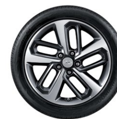
18" alloy wheel