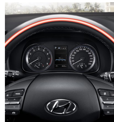
Available heated steering wheel Standard 60/40 split-fold rear seats