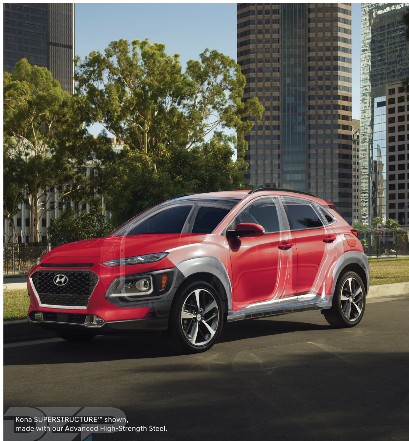
Kona SUPERSTRUCTURE™ shown, made with our Advanced High-Strength Steel.

We test our vehicles in areas like the Arctic, our proving grounds in the Mojave Desert and on Germany’s world-famous Nürburgring circuit to deliver the durability and reliability you demand. And not only do we package our vehicles with advanced safety and technology, we back all our vehicles with one of the best automotive warranties in the industry. This means you really can have it all, quality and value together.