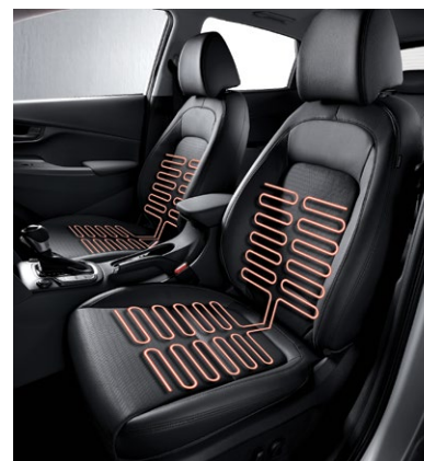
Standard heated front seats Available power sunroof