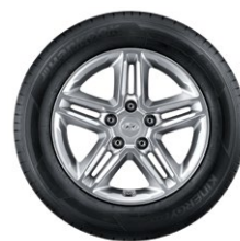
16" alloy wheel