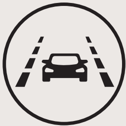
Lane Departure Warning with Lane Keeping Assist