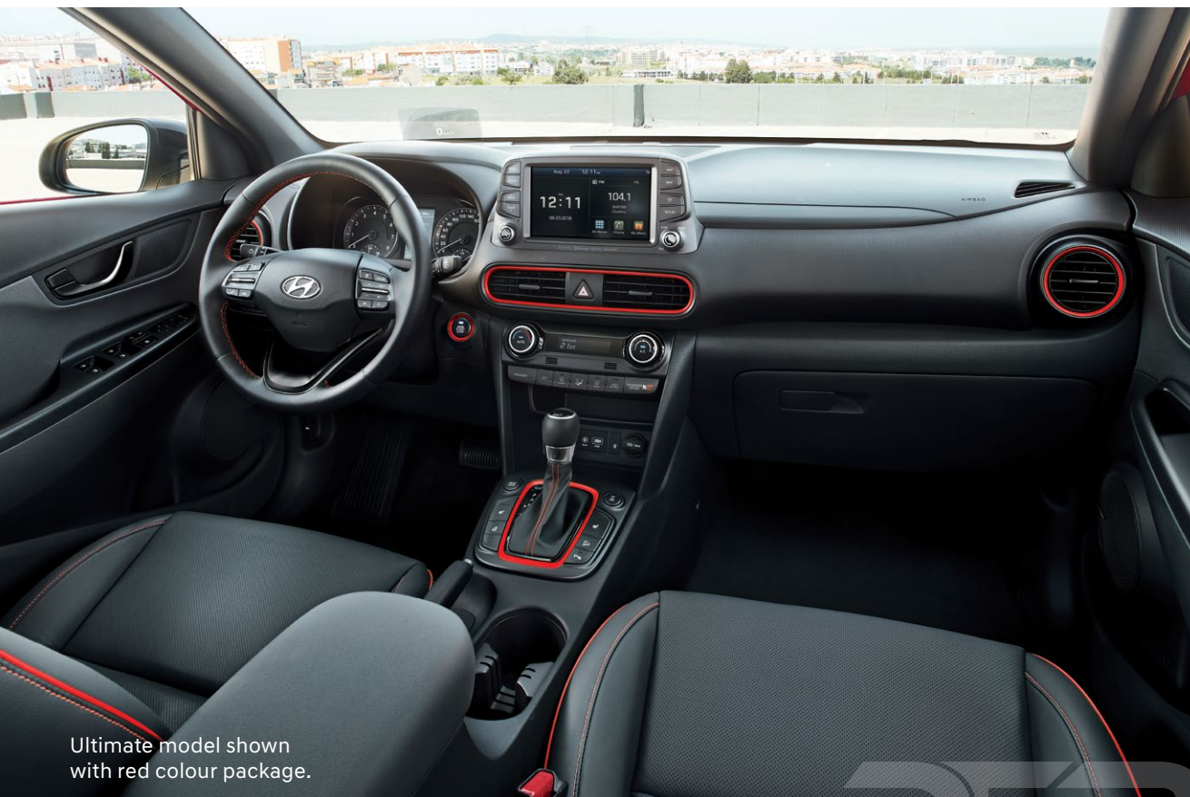
Ultimate model shown with red colour package.

Step inside and instantly experience an exceptional level of comfort thanks to a wealth of features that includes heated front seats, an available heated steering wheel and an available 8-way power-adjustable driver's seat. The Kona's compact SUV size doesn't just help you manoeuvre around the city with ease, it also gives you a higher seating position to get a better view of your surroundings.