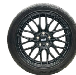
18" BBS alloy wheel

Standard on Trend model with Urban Edition package